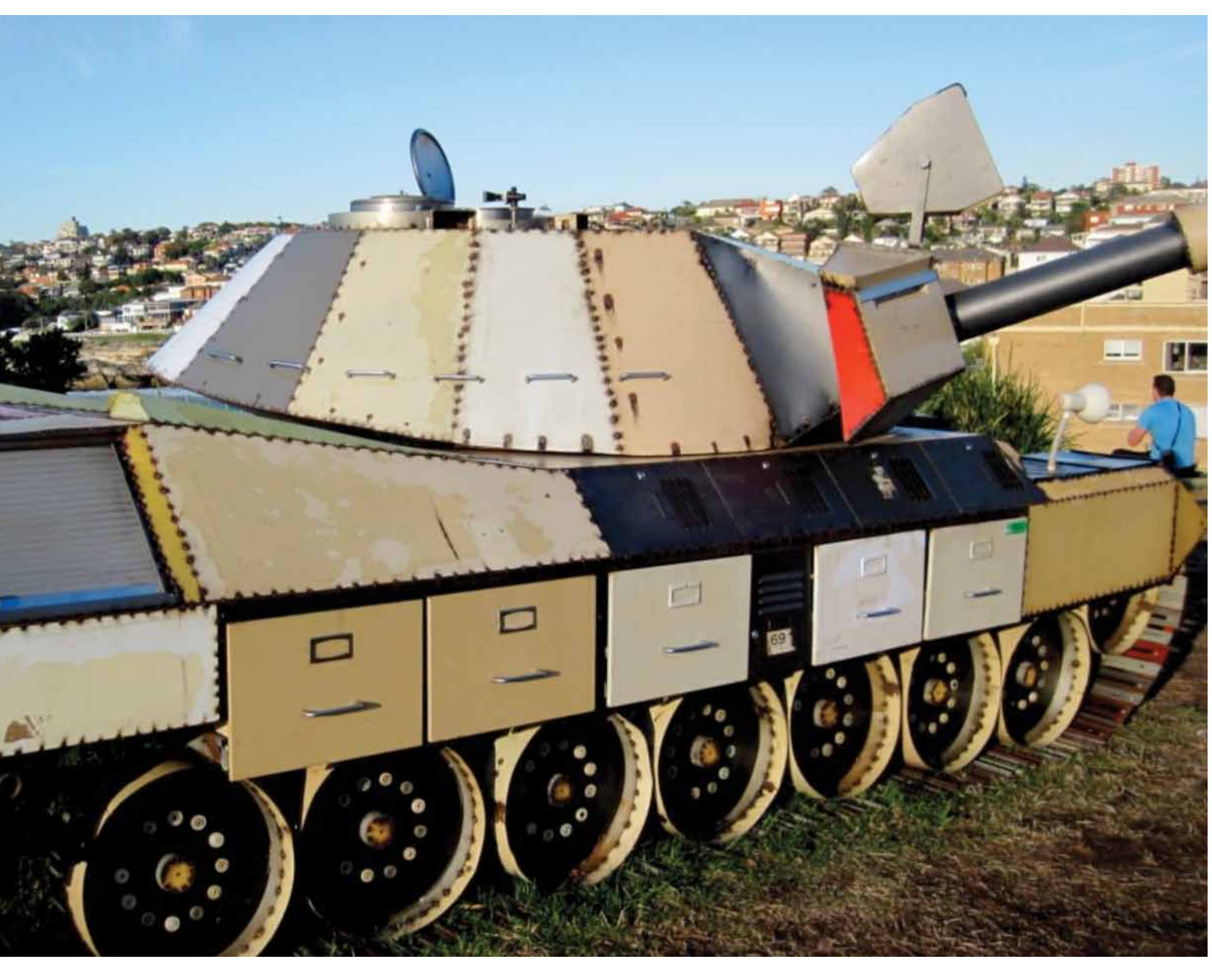
The Bureaucratic Tank. Made up of filing cabinets. It crushes human beings and leaves a trail of paper behind it.

"There are people who say, 'If music's that easy to write, I could do it.' Of course they could, but they don't."