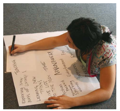
Flexible Learning Options (FLO) in the South

education, from family problems to alcohol and drug abuse. Most are very small in scale, but good pointers to how the education system could better engage teenagers. For example, Tjinatjunanyi – Footprints to Freedom – is an ICAN project which is helping over a dozen local Aboriginal teenagers in the Davenport community near Port Augusta. The program, which is a collaborative effort between the state government and the Uniting Aboriginal and Islander Christian Congress, operates from a community centre, and provides a mix of literacy and numeracy classes and a day per week on cultural activities. Learning is supported by providing a healthy breakfast and lunch and regular physical activity. There's a strong emphasis on making the classes culturally relevant and involving families and the community. Each student has a mentor who provides personal support and encouragement as well as serving as a role model. Many