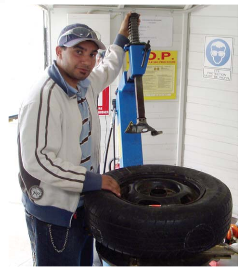
Upper Spencer ICAN

As South Australia's economy picks up after a period of relatively slow growth the state will need not only more trained nurses, carers and other health workers to provide support for the growing population of elderly people but also more trained mechanics, engineers, planners and technicians in the growing mining and defence industries. Attracting skilled migrants is one way to meet these demands, but South Australia will be competing with other states and other countries for such people. The long-term priority therefore has to be improved education and training for people born and brought up in the state.