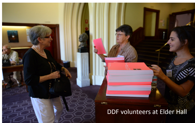
DDF volunteers at Elder Hall