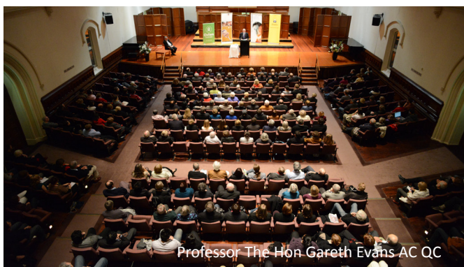
Professor The Hon Gareth Evans AC QC

http://reverb.net.au | facebook.com.au/reverb