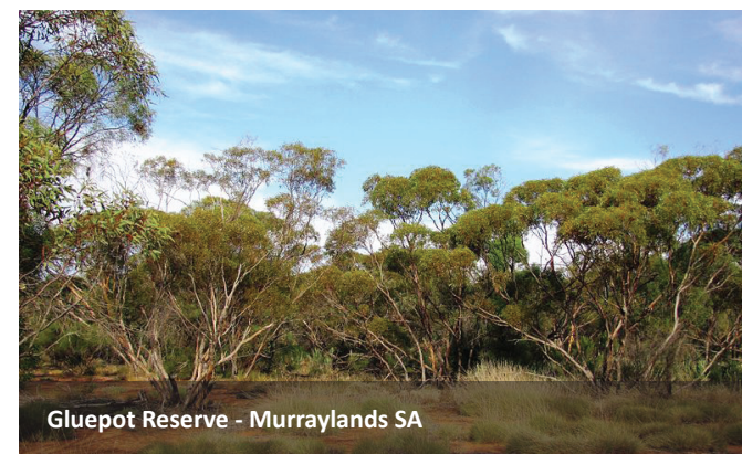
Gluepot Reserve - Murraylands SA