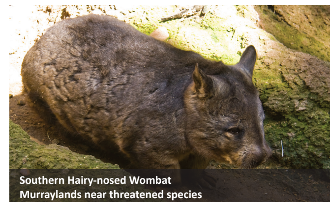
Southern Hairy-nosed Wombat Murraylands near threatened species