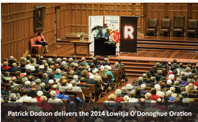
Patrick Dodson delivers the 2014 Lowitja O'Donoghue Oration

Our Mob is an annual exhibition of works by SA Aboriginal artists conducted by the Adelaide Festival Centre. Art works are received from across South Australia including regional and remote areas. It is conducted in collaboration with AnanguKu Arts and Culture Aboriginal Corporation, and Country Arts SA.