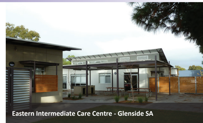
Eastern Intermediate Care Centre - Glenside SA