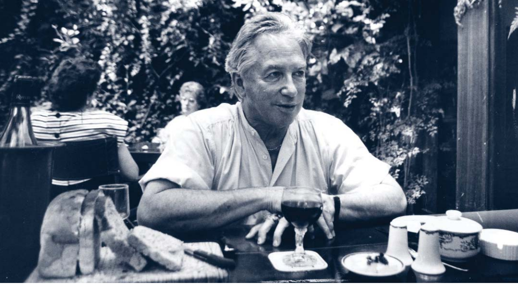
Enjoying an al fresco meal at The Barn restaurant in 1989.